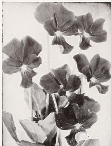
VIOLA JERSEY GEM